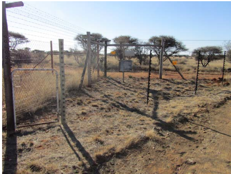
Figure 11. The solar panel was located in the designated area behind the electric fence.

Many wild animals had been sighted on the aerodrome property over a period of time, which included different species of antelope, jackal, rabbits, aardvark and many others. The movement of wildlife was found to be slightly more problematic on the western side of the aerodrome, where the aerodrome borders on a nature reserve. It was also in this area where the aerodrome licence holder attempted to restrict animal access by installing an electric fence. However, the solar panel that was installed to provide the electrical current for the fence was reported as stolen on 22 June 2010. At the time of the accident, the solar panel had not been replaced, which rendered this section of the fence inactive/disabled.