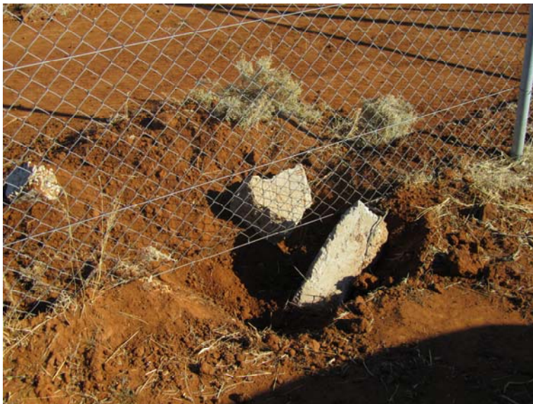
Figure 8. A substantial hole that was previously closed up and then dug open again.