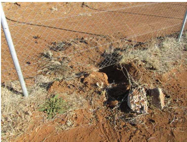
Figure 9. A substantial hole that was previously closed up and then dug open again.