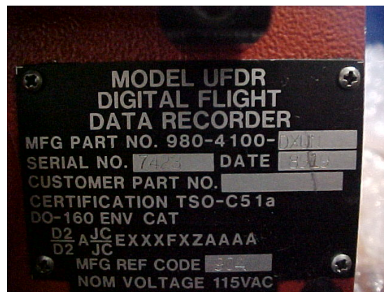
Figure 3. A view of the flight data recorder recovered from the aircraft.

The aircraft was equipped with a Honeywell solid state flight data recorder part number 980-4100DXUN, serial number 7423. The unit was undamaged and there was no apparent impact damage to the ULB, which remained attached to its bracket. The unit showed no signs of external damage.