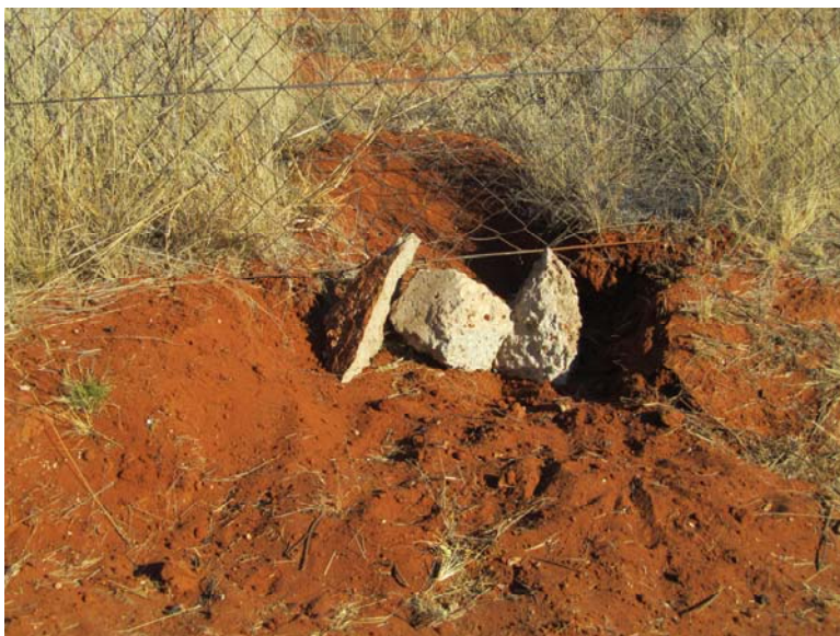
Figure 10. A substantial hole that was previously closed up and then dug open again.