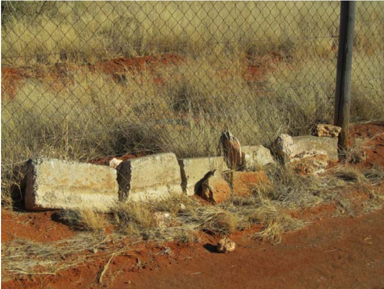
Figure 7. A section of the fence where concrete blocks were used to restrict animal access.