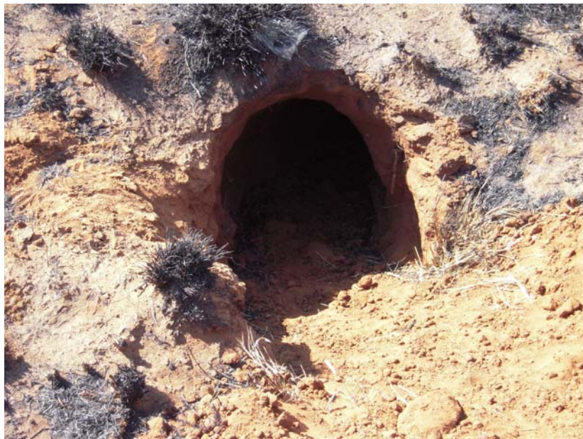
Figure 15. The photo displays one of many animal holes/shelters on the aerodrome property.