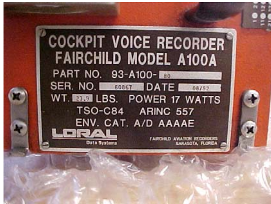
Figure 2. A view of the cockpit voice recorder recovered from the aircraft.

The cockpit voice recorder (CVR) was recovered from the accident aircraft. The CVR was a Fairchild Model A100A, part number 93-A100-80 and serial number 60867. An external examination of the CVR revealed that overall it was in a good condition. The underwater locator beacon (ULB) or pinger was undamaged.