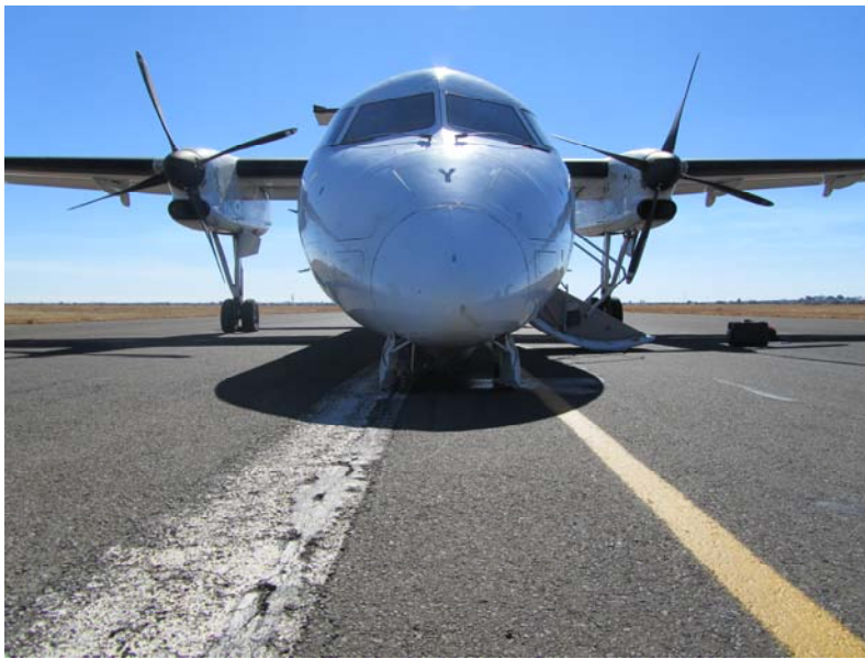
Figure 5. Final position of the aircraft as it came to rest on the runway centre line.