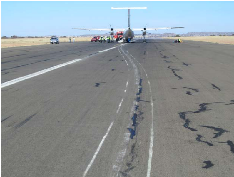
Figure 4. A view of the nose gear strut assembly and the gear doors scraping on the runway.

The pilot managed to keep the nose of the aircraft up for a further 479 m past the point of impact. Although both nose wheel tyres were found to be deflated, there was a clear blowout on the right nose wheel tyre some 400 m past the point where the nose gear had first made contact with the runway surface. Fourteen (14) m past the tyre blowout marking, both nose gear doors started making contact with the runway surface, followed by the nose gear strut assembly some 186 m further on. The aircraft came to a halt on the runway centre line 1 838 m past the threshold of runway 20.