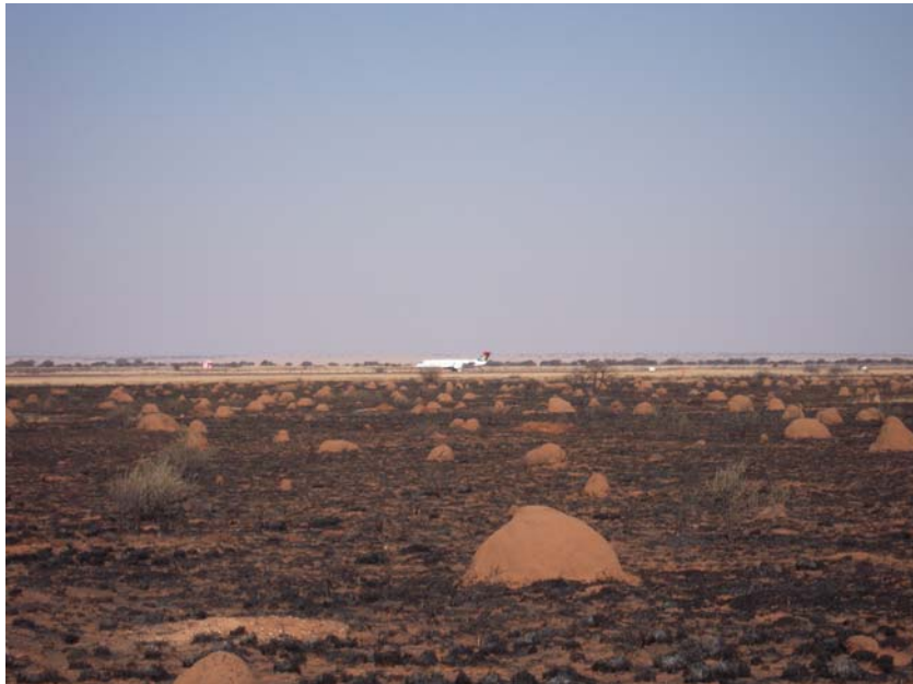
Figure 14. A view of the termite mounds located on the north-western side of the aerodrome.

At the time the investigating team visited the aerodrome again, being 5 August 2010 several of the areas were still not subjected to any burning (still grass covered). It could however, be seen from the photo that there was indeed a serious termite mound population within the boundaries of the aerodrome property. It was noted during the visit in question that the aerodrome licence holder had indeed commence with a program whereby they had obtained the services of a contractor to start demolish these termite mounds by making use of earth moving equipment.