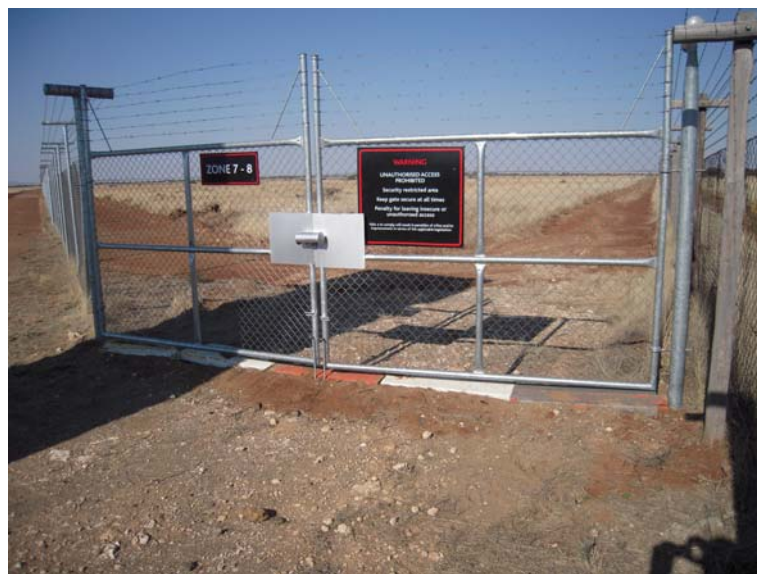
Figure 12. Access gate within the perimeter fence with solid concrete foundation.

It was noted that one of the perimeter fence access gates had a solid platform that consisted of concrete blocks. This practice was however, isolated to this gate only. See photo below.