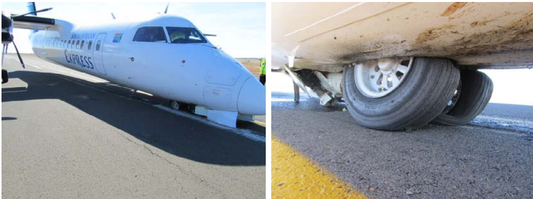
Figure 1. A view of the aircraft as it came to rest on the runway with the nose gear collapsed backwards.

1.3.1 The aircraft sustained substantial damage to the nose landing gear and lower nose fuselage structure.