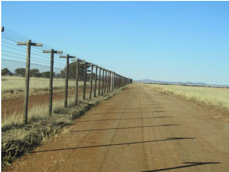
Figure 6. A general view of the aerodrome perimeter fence, consisting of wire meshing.

repairs to the perimeter fence fell under their portfolio, and with them not being on duty over weekends and public holidays, no maintenance intervention took place on the fence over weekends when required. The photos below reflect the observations that were made less than 24 hours after the accident occurred.