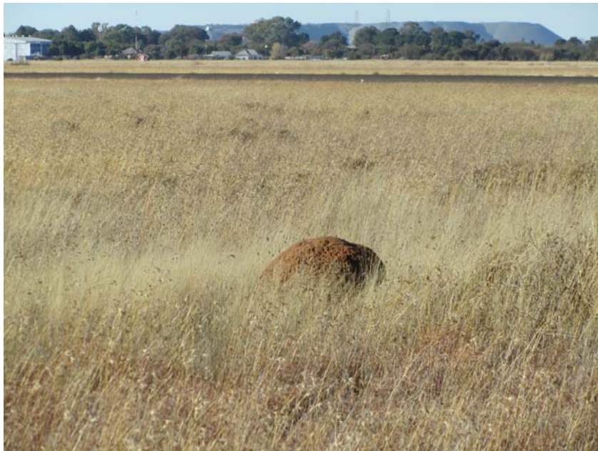
Figure 13. A general view of the aerodrome property with runway 02/20 in the background.

During an inspection of the aerodrome property it became apparent that hundreds of termite mounds were located on the property. According to a senior aerodrome official they had had a programme in place to try to address this issue, whereby they physically broke down the mounds and filled it with poison; however, this programme ceased some time ago. A substantial number of these mounds were observed in the area around the runways. With termites being the staple diet of an animal like the aardvark/anteater, the animals most probably found their way onto the aerodrome property by digging holes underneath the fence to feed on the food supply available. The photos on the next page display the environment before the grass was burnt and the second photo after the grass was burnt on the north-western part of the aerodrome property.