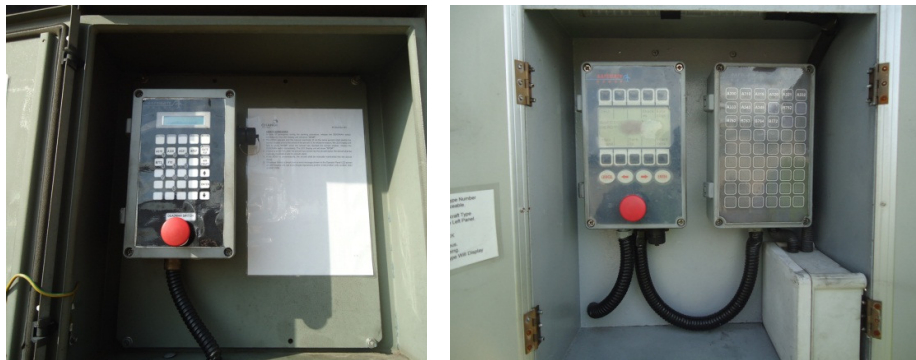
Figure 3: 30-key (L) and 54-key (R) operator panel