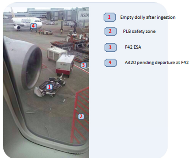
Figure 1: Empty dolly and surroundings after the incident