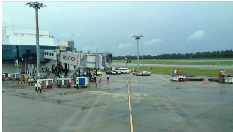
Figure 4: View of the cargo container and the BTs in the simulated docking